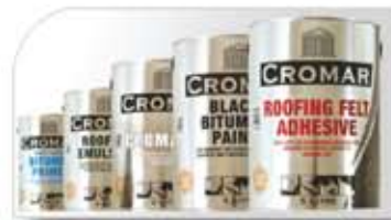
CROMAR BUILDING PRODUCTS

Bitumen roof waterproofing compounds continue to represent exceptional value for flat roof weatherproofing and emergency repairs. Our range covers every application. In addition, our polymer modified products offer additional performance and flexibility.